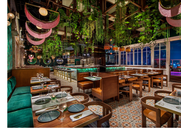
GOLDEN HOUR: The AC Hotel Downtown Los Angeles/Moxy Hotel: (right, from top) Que Barbaro restaurant, Gavin Brennan from the eBike Tours LA, Crypto.com stadium, a genuine sign from a bike tour in the Hollywood Hills