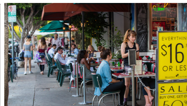
HANG WITH THE LOCALS: Outdoor dining at Larchmont

must-try business venture ( ebiketoursla.com ; €150). The trip into the hills is the ideal way to prove that this sometimes chaotic and surprisingly expansive city has so much more than a walk of fame and fancy hotels and clubs. The beauty of Los Angeles is that you will get whatever you want from it. And with some planning you can explore almost-untouched neighbourhoods like Glendale, Larchmont,